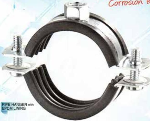
PIPE HANGER with EPDM LINING

Most Reliable, Durable & Corrosion Resistant