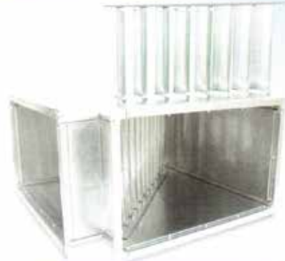
TURNING VANE SYSTEM