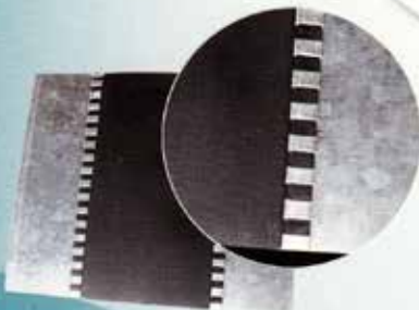
Strong Double Seam Lock